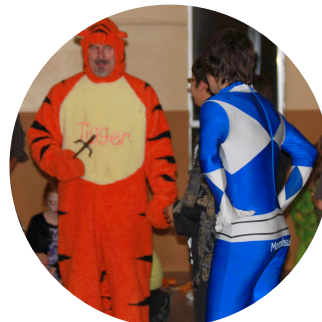
Tigger vs. Power Ranger