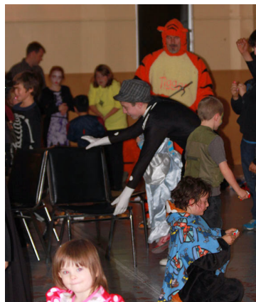
Musical chair madness!